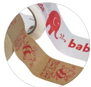
Self-adhesive paper tape for an eco-friendly choice.