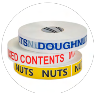
Printed machine rolls in positive and reverse print.

Our current range of stock inks are available as a downloadable PDF at www.kilby.co.uk/tapeinks