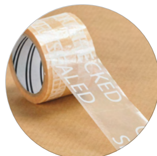
Transparent tape works well on brown corrugated boxes.