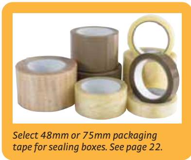
Select 48mm or 75mm packaging tape for sealing boxes. See page 22.